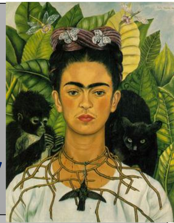
Frieda Kahlo, Self-Portrait with Thorn Necklace and Hummingbird , 1940